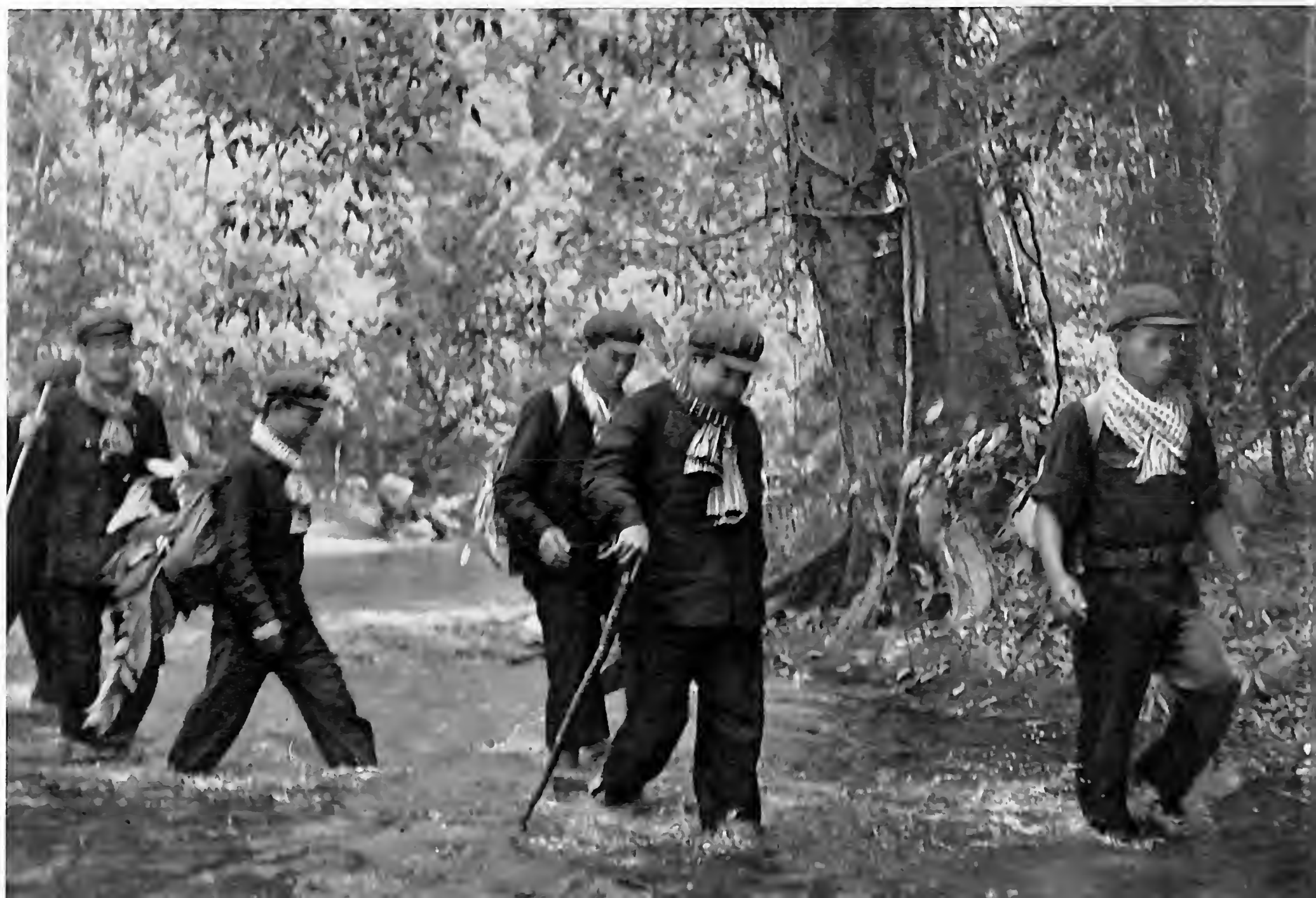
The Samdech fording a stream.